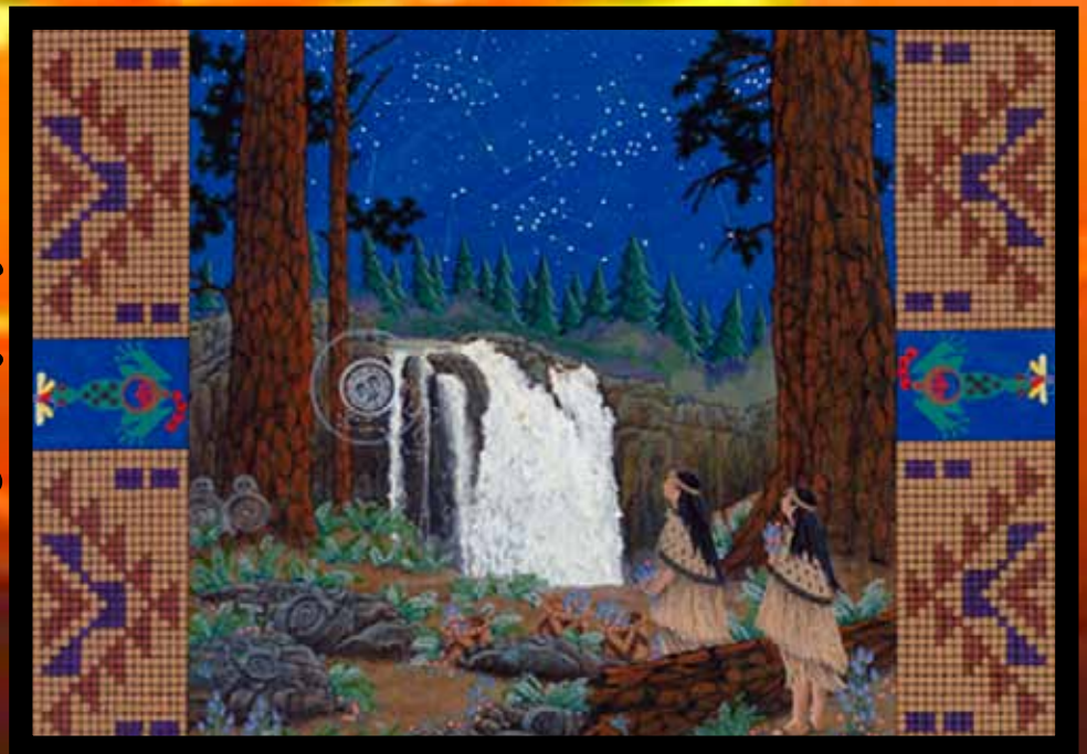
Chholing Taha (Cree)

South Puget Intertribal Planning Agency (SPIPA) 3104 SE Old Olympic Hwy. Shelton, WA 98584 - 360/426-3990