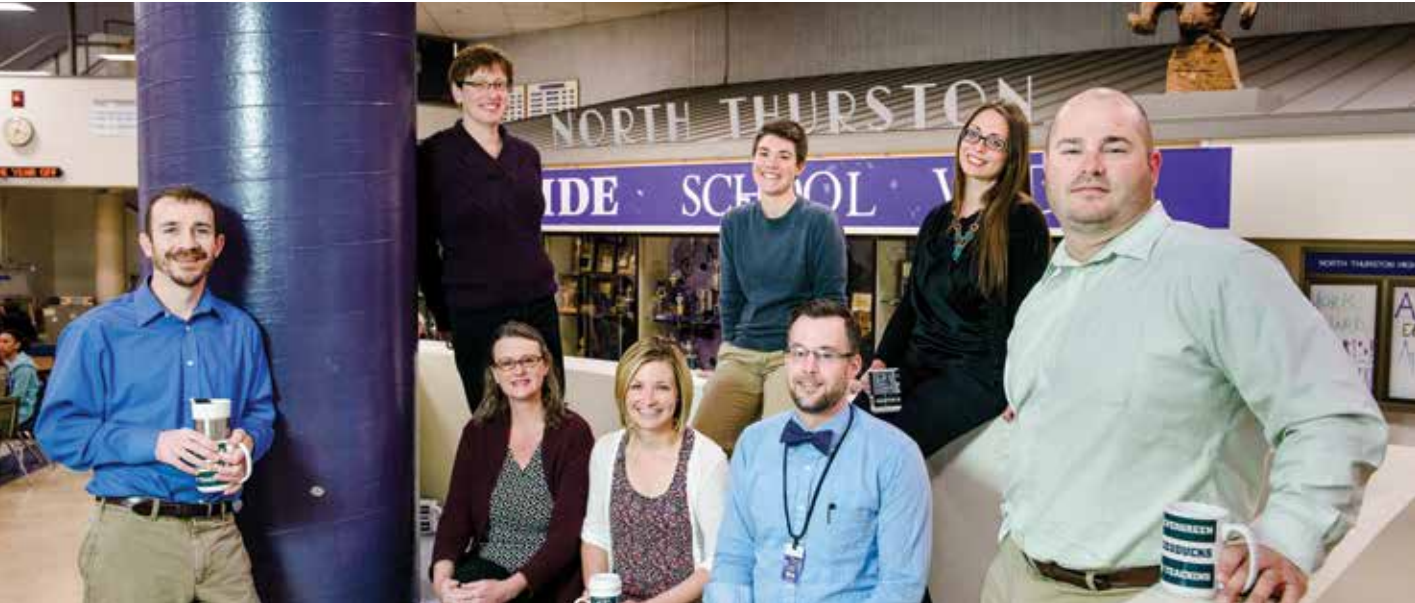
Eight of the MiT program alumni who are currently teachers at North Thurston High school in Lacey, WA.