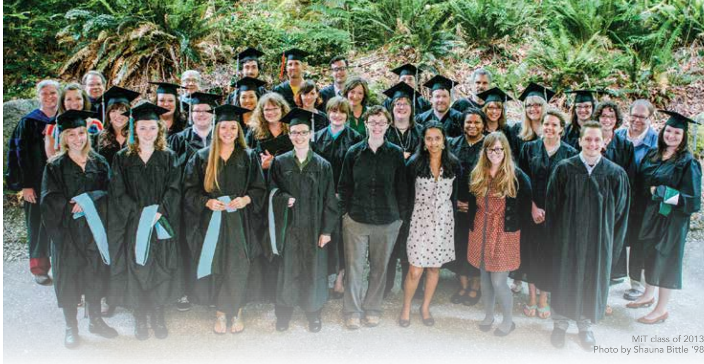
MIT class of 2013.