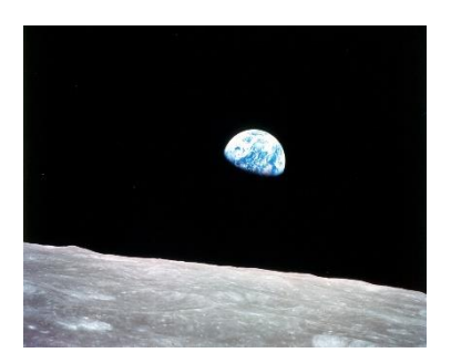
Figure 3. Earthrise (Anders, 1968)

The metaphor spaceship earth was popularized in the 1960s when the United States and the Soviet Union were in a "space race"; the historical man-moon-landing was achieved by the United States on July 20, 1969. Just prior to this event in 1968, astronaut William Anders snapped the famous photo "Earthrise" from a spaceship orbiting the moon, helping to solidify the image of the earth as its own spaceship (Figure 3).