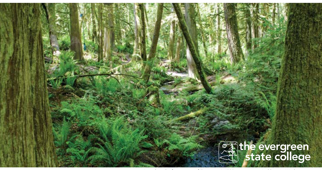
A peek at the forest, part of Evergreen's 1000-acre campus in Olympia, Washington.

TRAINING ENVIRONMENTAL LEADERS IN THE PACIFIC NORTHWEST SINCE 1984.