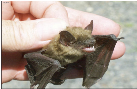
Brown bat ( Myotis lucifugus )

Not only would disturbing the bat roost be pushing legal boundaries without providing some sort of mitigation measures, but perhaps unethical, as many people really like the charismatic night sprites. The bats at the farmhouse indeed have a Facebook page dedicated solely to them by admiring fans! (I didn't create the page, by the way!) Fueling concerns about the Evergreen bats is the fact that bat populations are declining worldwide; as of 2002 56% of U.S. bats were listed as threatened or endangered.