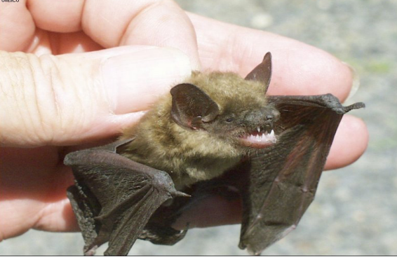
Brown bat (Myotis lucifugus)

Not only would disturbing the bat roost be pushing legal boundaries without providing some sort of mitigation measures, but perhaps unethical, as many people really like the charismatic night sprites. The bats at the farmhouse indeed have a Facebook page dedicated solely to them by admiring fans! (I didn't create the page, by the way!) Fueling concerns about the Evergreen bats is the fact that bat populations are declining worldwide; as of 2002 56% of U.S. bats were listed as threatened or endangered.