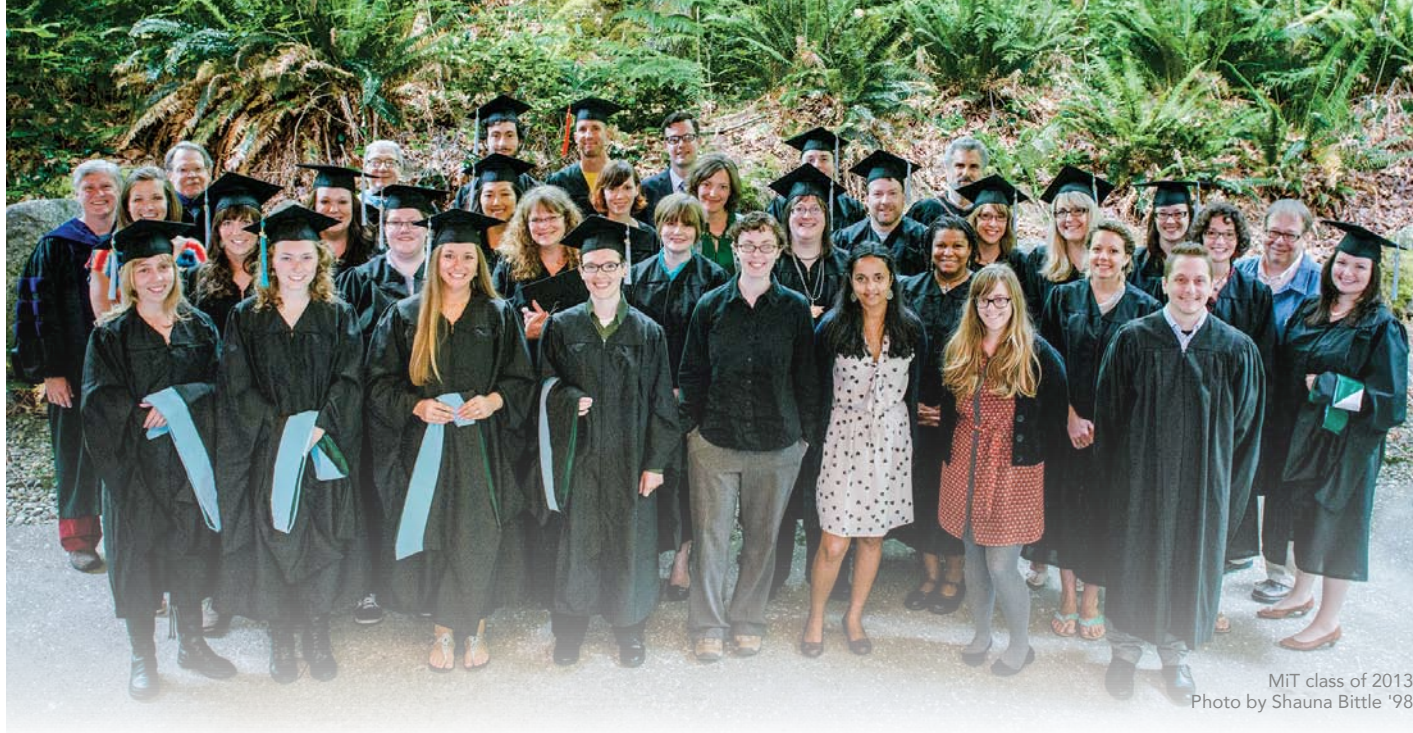
MIT class of 2013.