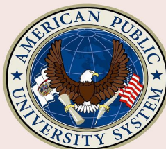
Michelle Newman - University Registrar

An official electronic transcript is available as a document with a digital certificate available through a secure portal. An official paper transcript is printed on blue security paper with the name of the university printed in white type across the face of the document. A raised seal is not required. Official paper transcripts are placed in sealed envelopes.